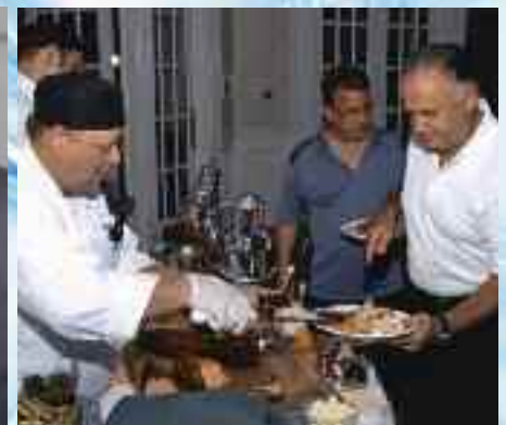
A day of enjoyment.