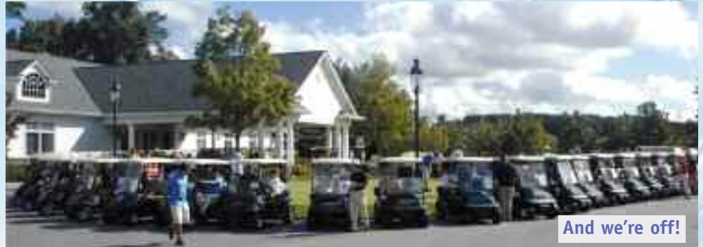
And we're off!